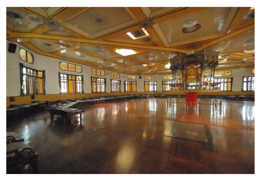
Chan Hall, Gao-min Si

chamber, which houses the main meditation seating. The outer halls have extra sitting space for large retreats. There were less than 100 seats set out and we saw only about 60 nuns and monks at morning service, with nuns out-numbering monks. On entering the hall they had us walk rapidly around the central platform which contained 8 Buddha statues facing each of the 8 octagonal sides of the building. We did this for 10 minutes, getting very fast towards the end. The effect was energising.