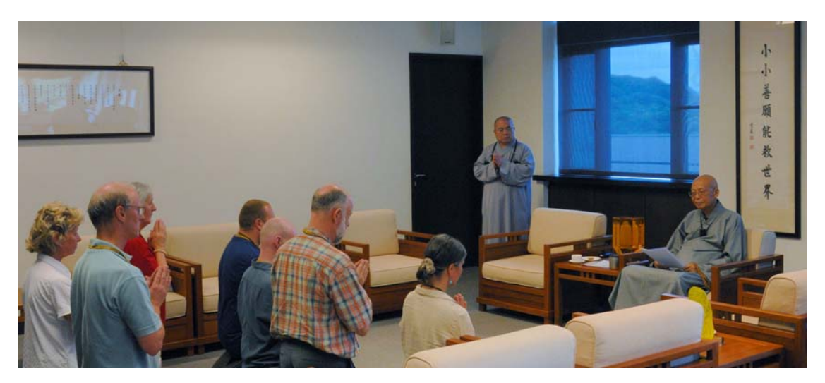
Refuges and Precepts Ceremony, Dharma Drum Mountain