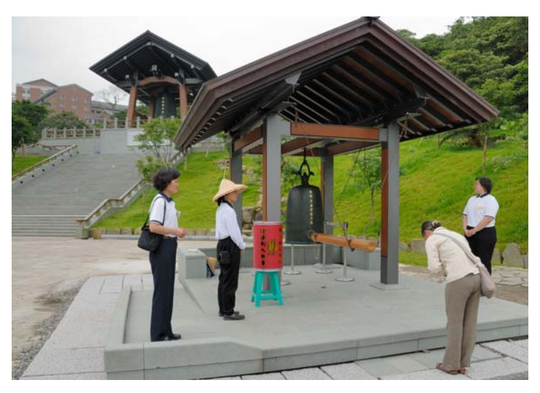
Lotus Bells, Dharma Drum Mountain

We arrived at DDM at about 6.30pm and immediately had dinner then most of us went to bed as we were very tired and had an early start for 6am Morning Service the next day.