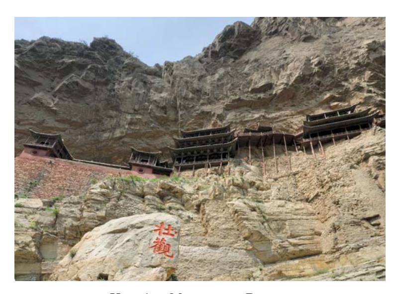
Hanging Monastery, Datong

The presence of the centuries is magical, the 'tingle' is strong. We are shown a cave inside which there is a big stone Buddha made in 401 CE. Sixteen hundred years of silence. When I bow, I really bow. There is a very formal meeting in a beautiful formal room with the two most senior monks. The talk is formal. The questions and answers too, are formal. We are given more wrist malas and lots of green tea. I love being treated like an important guest: this is almost a regal, state occasion. It seems that they no longer practice silent illumination there. It seems that this practice is very thin on the ground. The morning and evening services are a trial. I get dizzy and have to sit down outside. They have fabulous dramatic drum and bell routine.