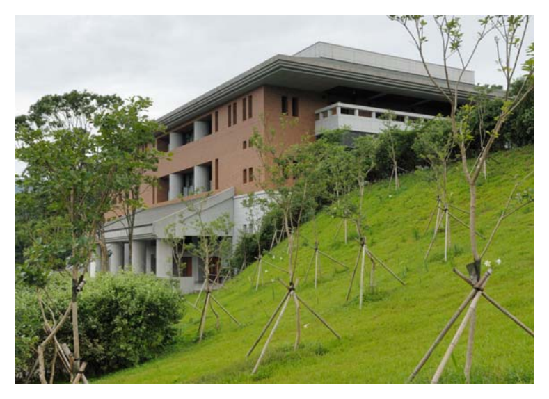
Chan Hall, Dharma Drum Mountain

The next day we went to Morning Service again, followed by breakfast. Breakfast comprised rice, vegetables and tofu, much as all other meals. After breakfast John and I went off to Master Sheng-yen's private house (the guides said that most monks don't even know it exists.) It was up a track above the Monastery buildings. The house, a single story bungalow, reminded me of property designs in parts of the USA. I had asked Rebecca to get me an interview to follow up Master Sheng-yen's request last time I met him that I should do so next time our paths crossed. The bungalow was swarming with photographers who took pictures of John and me arriving and leaving. However they were not allowed into the interviews, which Shifu regarded as personal Dharma interviews. Rebecca Li translated for both of us