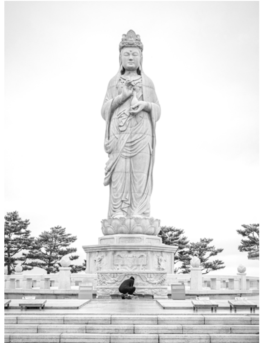
GWANEUM (GUAN YIN) STATUE, NAKSANSÄ TEMPLE, SOUTH KOREA